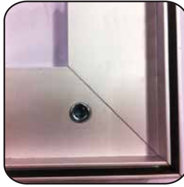
Connect profiles together and tighten lock. Image above shows a good connection.