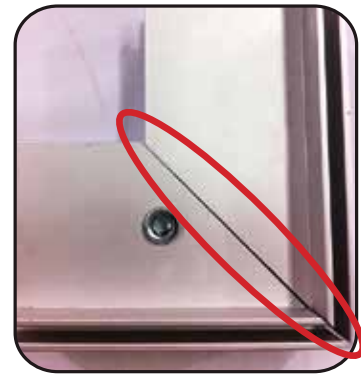
Image above shows a bad connection. If the corners are not lined up properly it will cause problems.