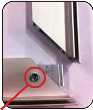
Loosen this lock prior to connecting the two profiles together.

Start by connecting all corners of the frame. Make sure the lock is loose and slide the two profiles together. Then tighten the lock with the allen wrench. Connect one corner at a time. See images below for further instructions.